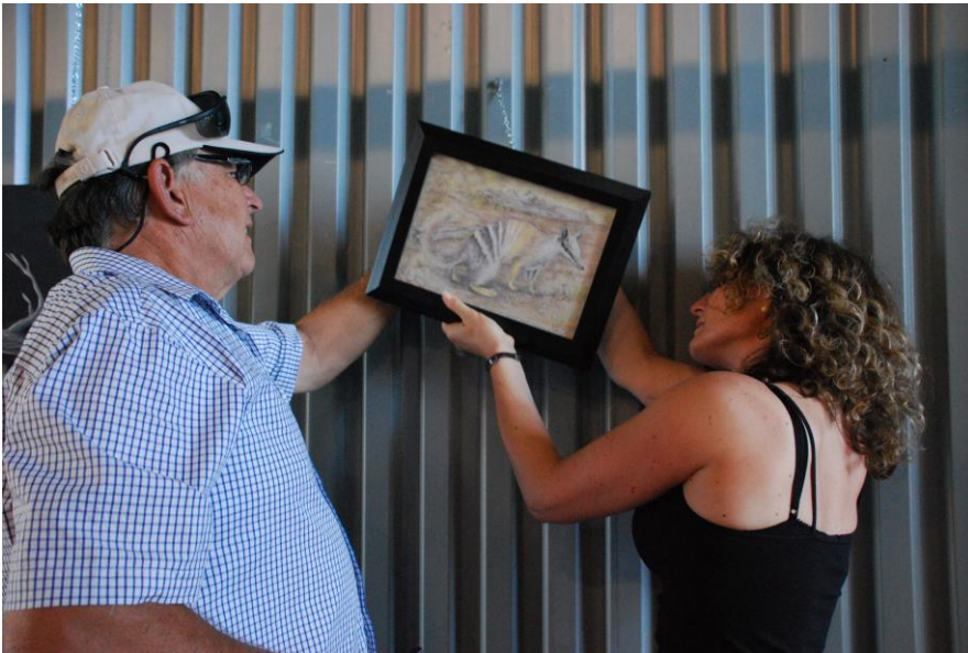
Art Exhibition preparations