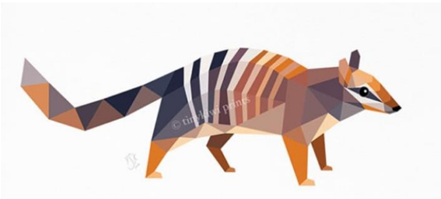
Art work by Yolanda