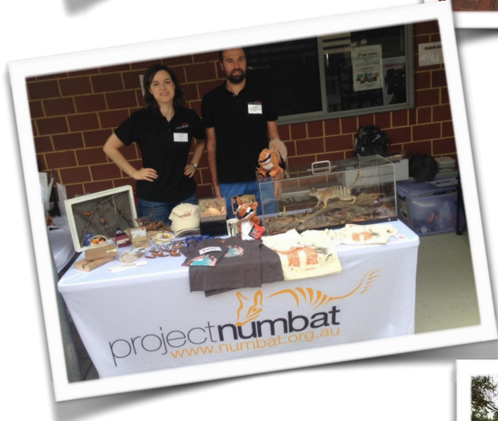
Saturday 19 March Burrendah Primary School Fair (40 th Anniversary) Willetton