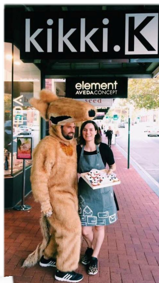
Thursday 17 March kikki.K Charity Event Subiaco