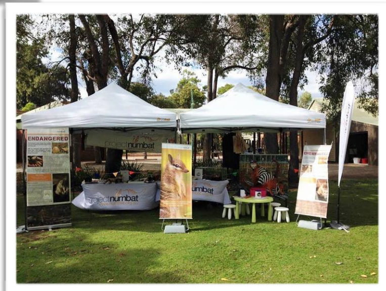
Sunday 10 April Envirofest Whiteman Park