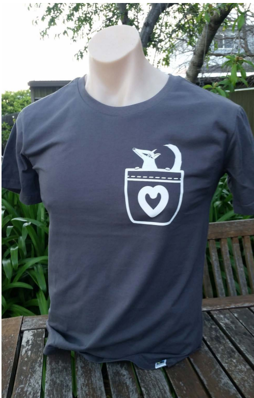
T-shirt The one you've been waiting for! Adult $35

We've selected some of our best sellers for you. Find more unique gifts on numbat.org.au