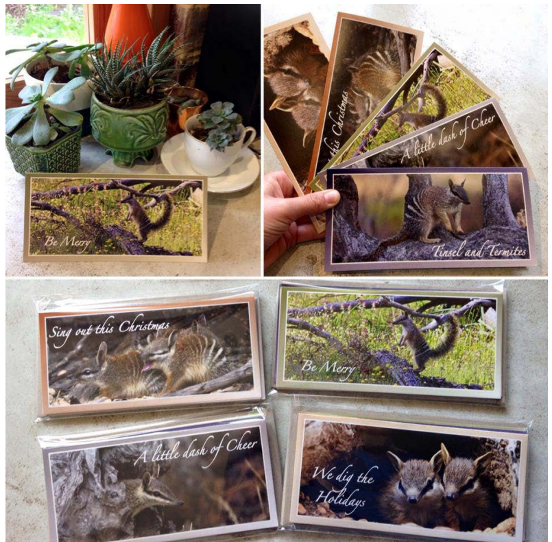
Christmas Cards 5 designs – recycled paper $22