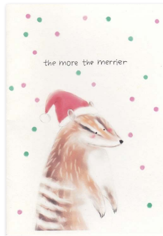
Christmas Card Single card $6

We've selected some of our best sellers for you. Find more unique gifts on numbat.org.au