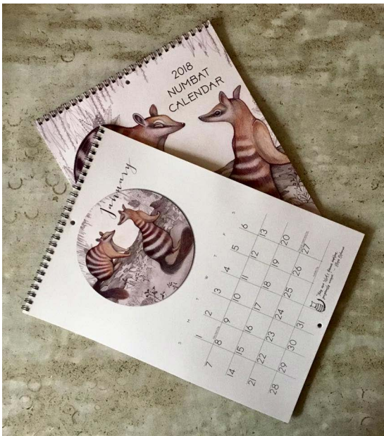
Calendar 14 months – recycled paper $20

Make Christmas shopping a breeze this year by selecting some unique gifts from the Project Numbat Webshop... And support a good cause in doing so! All proceeds from our merchandise sales go towards Numbat conservation and awareness, so each item you buy helps make a difference.